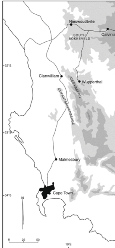
Figure 1: Western Cape Province and the Cedarberg Mountains

Source: Nel, Binns and Bek, “‘Alternative foods’ and community-based development,” 113.